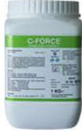
C-FORCE (STABILIZE VITAMIN C)