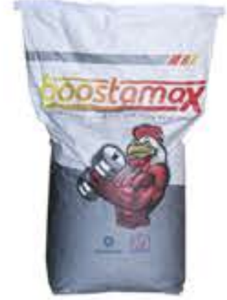
BOOSTAMAX (FEED PREMIX)