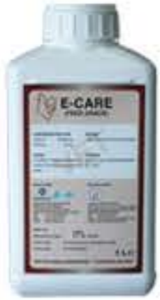
E-CARE (VITAMIN E + SELENIUM)

THESE ARE OUR BEST POULTRY RELATED PRODUCTS: