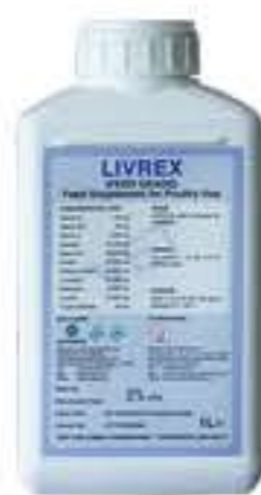
LIVREX (LIVER TONIC)