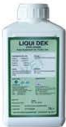
LIQUE DEK (VITAMIN A,D,E,K)