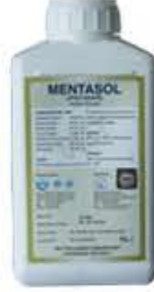
MENTASOL (ESSENTIAL OILS FOR RESPIRATORY PROBLEMS)