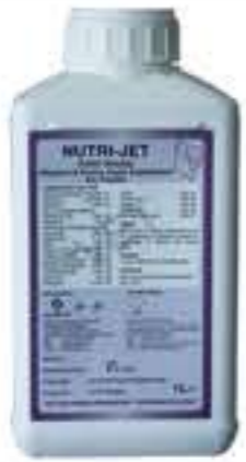
NUTRI JET (MULTI VITAMINS WITH AMINO ACID)