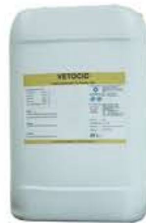
VETOCID (ORGANIC ACIDS)