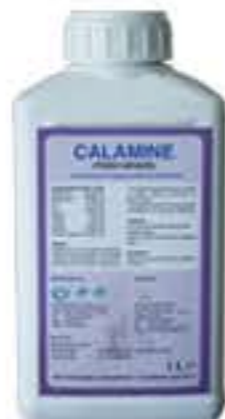
CALAMINE (Calcium + Phosphorous + Minerals)